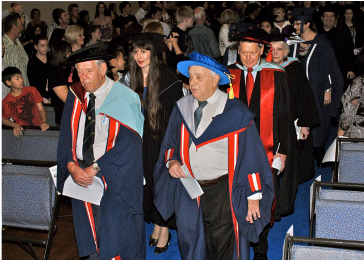
Academic procession enters the hall for the 2011 Graduation