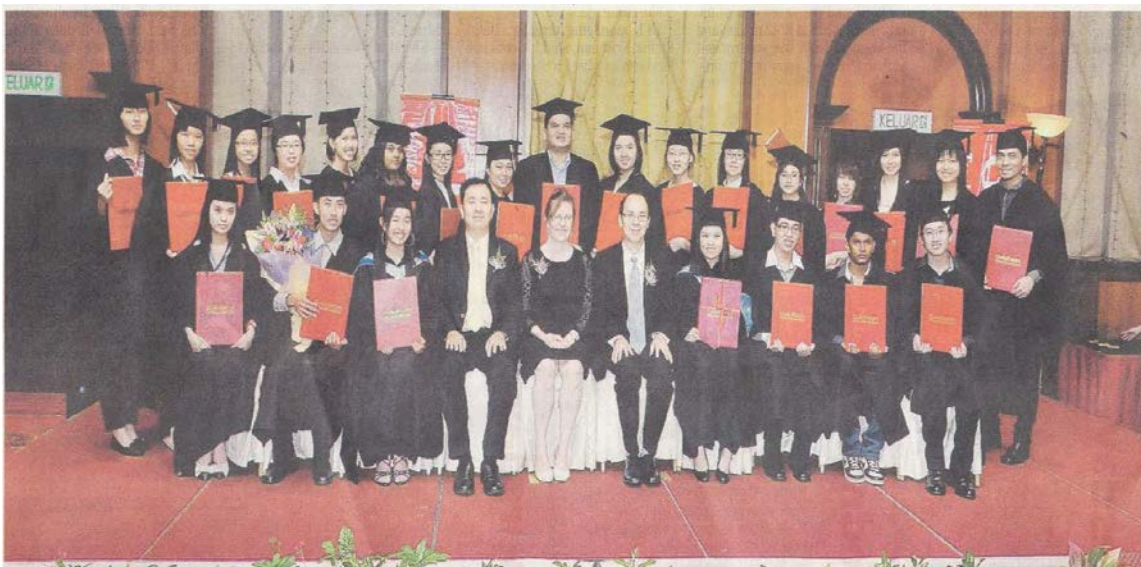
The students' diploma qualifications are recognised by the Public Service Department